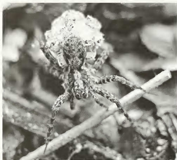
Fig. 2: Behaviour of Hygrolycosa rubrofasciata spiderlings on a substitute Pardosa amen-tata mother. The spiderlings remained on the cocoon surface and did not try to climb onto the female's opisthosoma.

onto the opisthosoma of H. rubrofasciata females, yet only few spiderlings were successful in settling on a substitute mother. The majority of spiderlings formed a cluster either beside the empty cocoon or on the ventral surface of the female's opisthosoma – in the area where the cocoon was touching the opisthosoma. Therefore, H. rubrofasciata females were carrying two 'pellets': the empty cocoon and the cluster of P. amen-tata spiderlings (Fig. 3). However, the females lost the clusters within the same day as the spiderlings emerged and the spiderlings dispersed the following day. Examination of the cocoon surfaces revealed no differences between the cocoon structures of both species (Figs 4, 5).